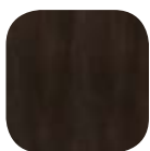
Also available in Graphite finish: GDS25LD-1412AG with Realogs™ GDS25GD-1412AG with Acrylic Ice