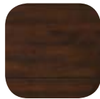
Show in Harper Brown finish