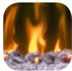
Also available with Acrylic Ice: GDS33GD-1670HB