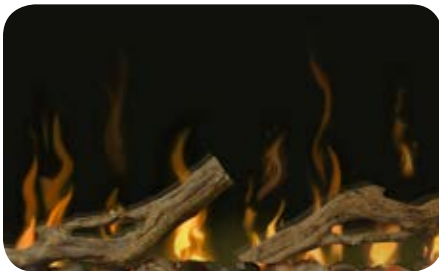
74" Driftwood and River Rock Accessory Package (LF74DWS-KIT)