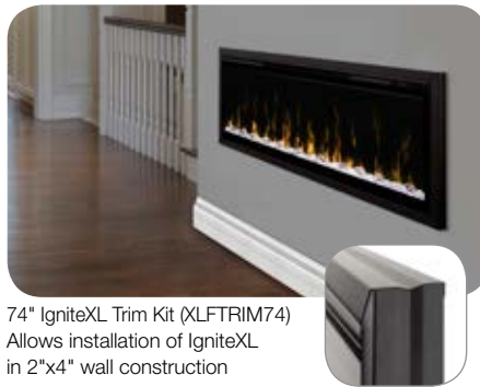
74" IgniteXL Trim Kit (XLFTRIM74) Allows installation of IgniteXL in 2"x4" wall construction