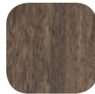
Also available in Elm Brown finish: GDS25LD-1571EB with Realogs™ GDS25GD-1571EB with Acrylic Ice