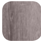
Shown in Steeltown finish