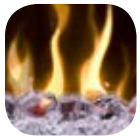
Also available with Acrylic Ice: GDS25GD-1571ST