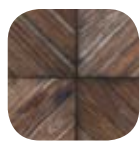
Show in Barley finish