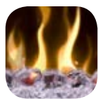
Also available with Acrylic Ice: GDS25GD-1589BY