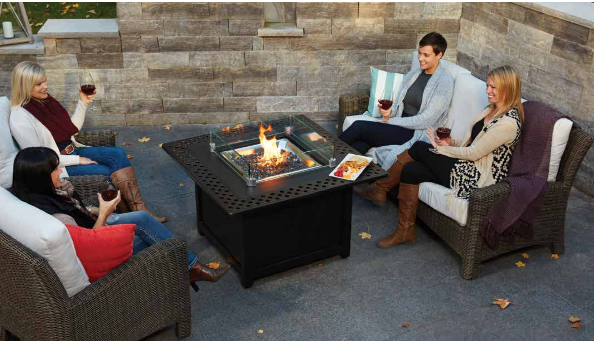
The Kensington Square