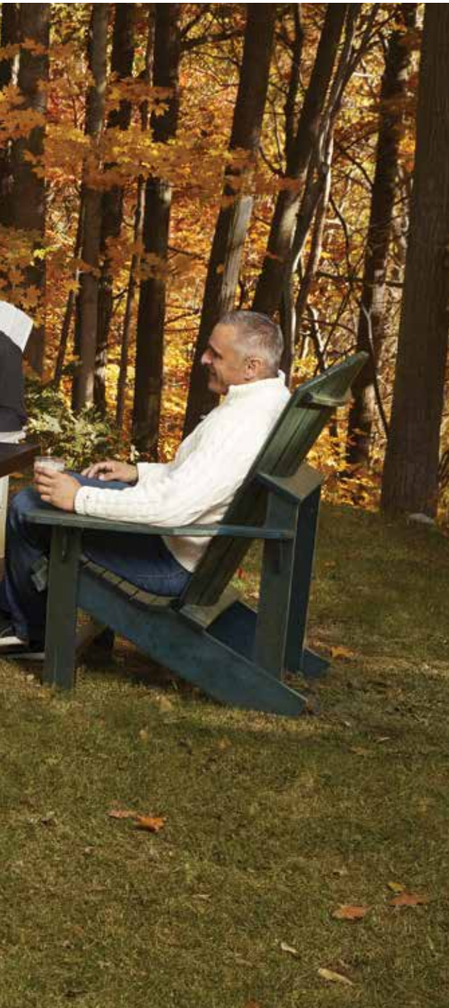
The St. Tropez Square