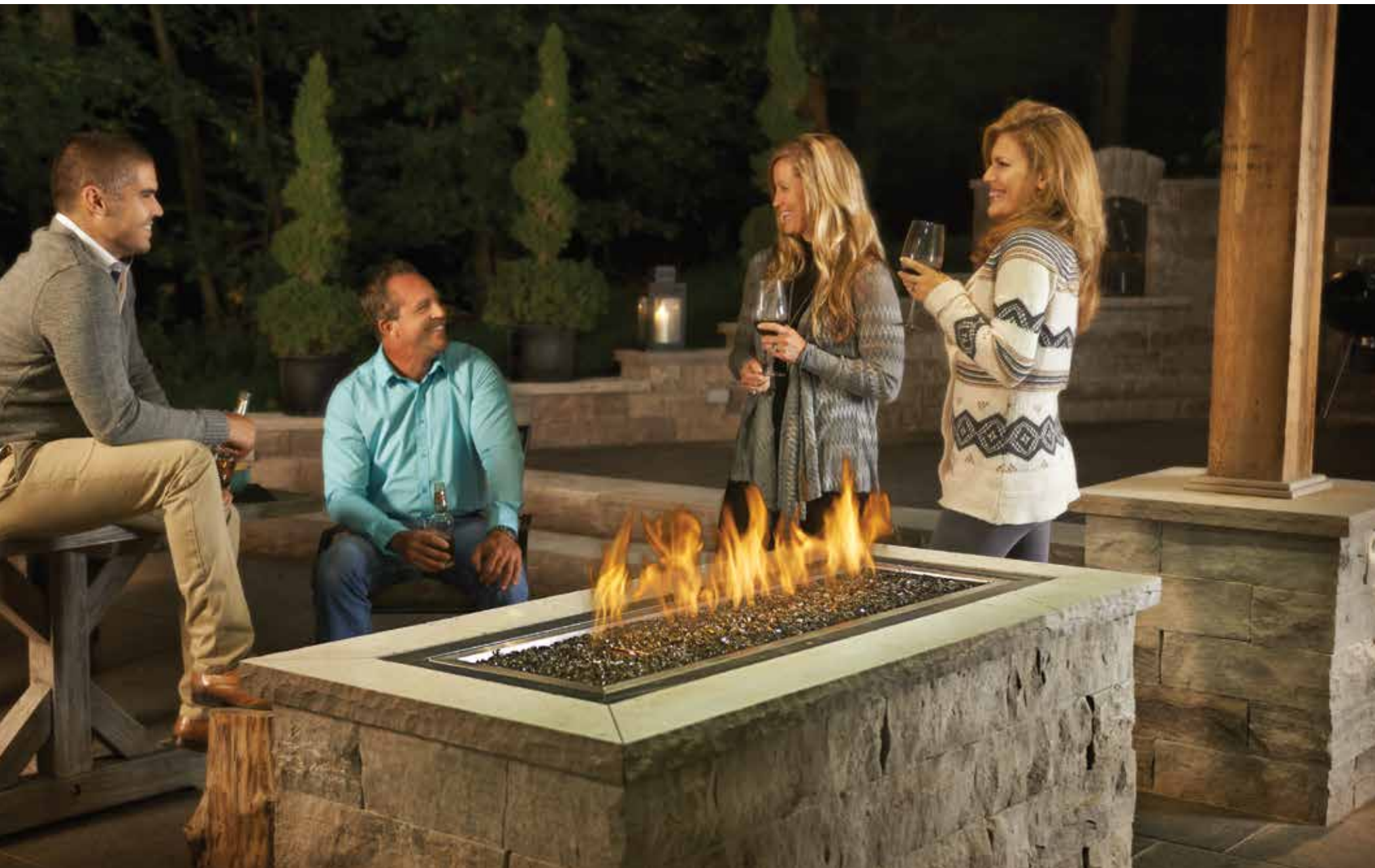
The Linear Burner Kit in a custom install application with Topaz ember bed