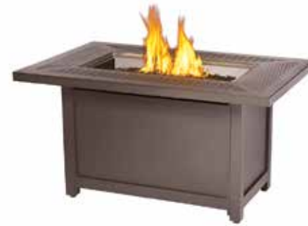
Rectangle - Bronze