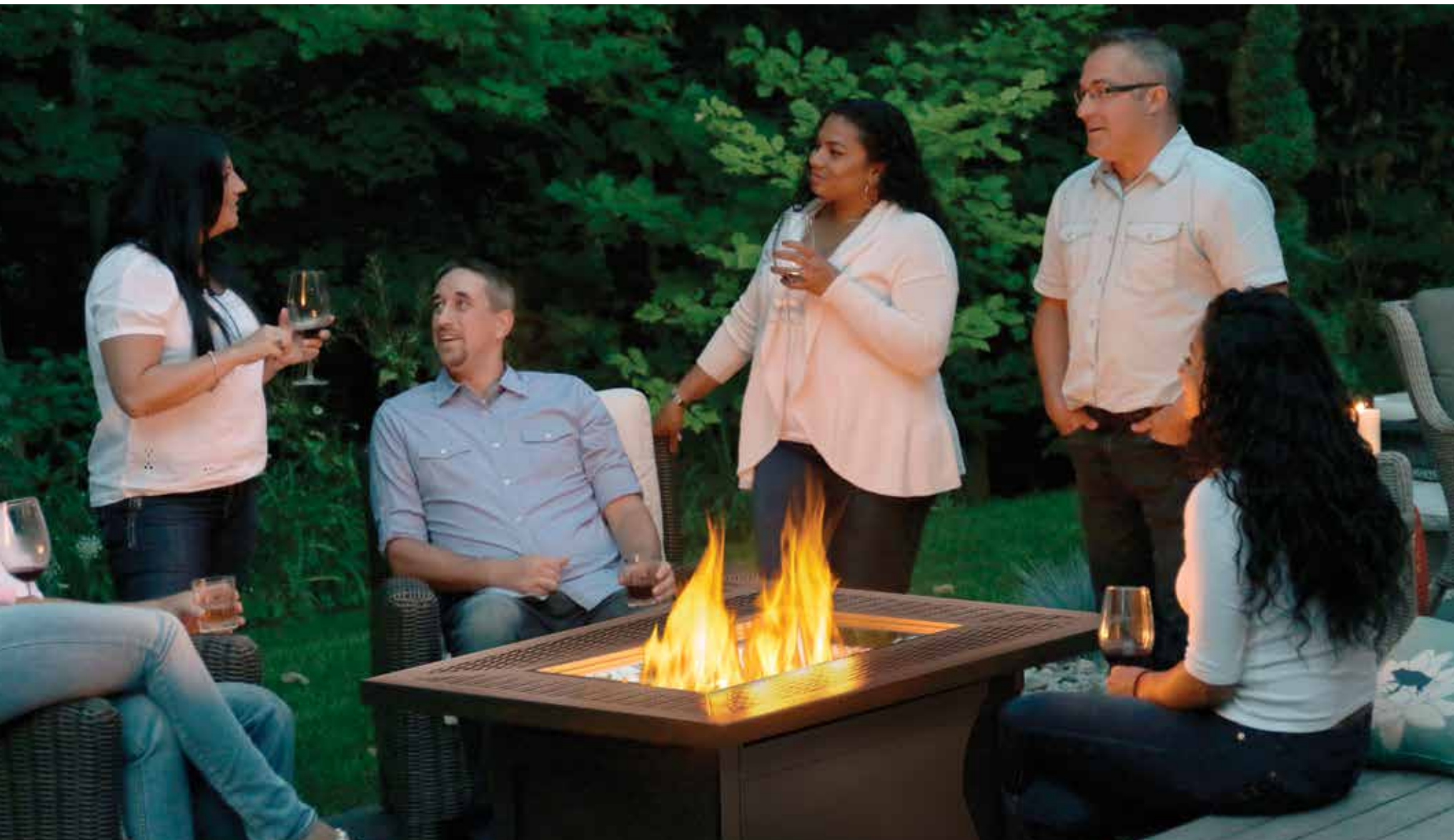
The Madrid Rectangle