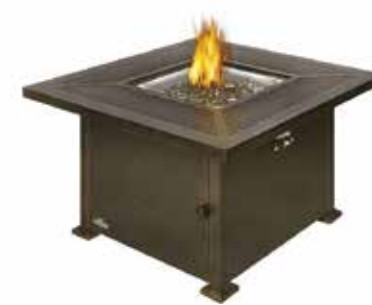
Square - Bronze