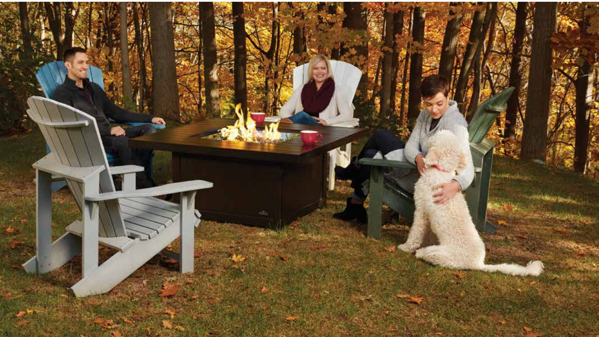
The St. Tropez Square