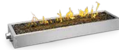
Linear Burner Kit - GPFL48