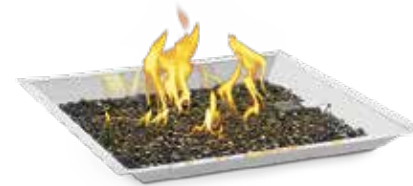
Square Burner Kit - GPFS