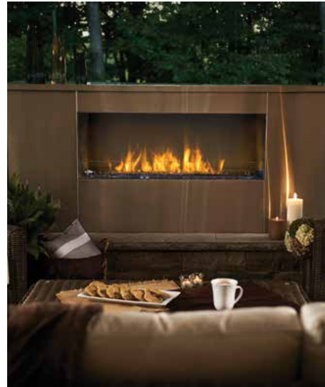
The Galaxy™ 48 one-sided model shown in a custom built-in stainless steel application