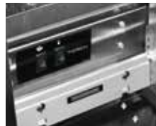
Convenient On/Off and Accent Light Switches (standard)