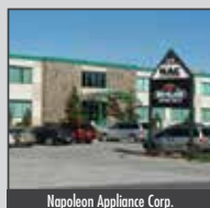
Napoleon Appliance Corp.

Outstanding Reliable... Each and every Napoleon® outdoor fireplace is designed and manufactured to strict quality testing standards. Napoleon® is registered under the world recognized ISO 9001-2008 quality systems.