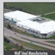
Wolf Steel Manufacturing