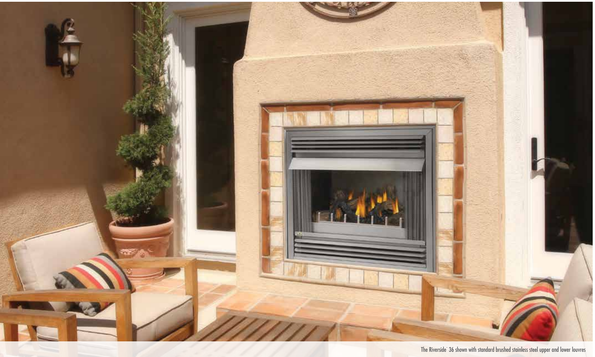
The Riverside™ 36 shown with standard brushed stainless steel upper and lower louvres