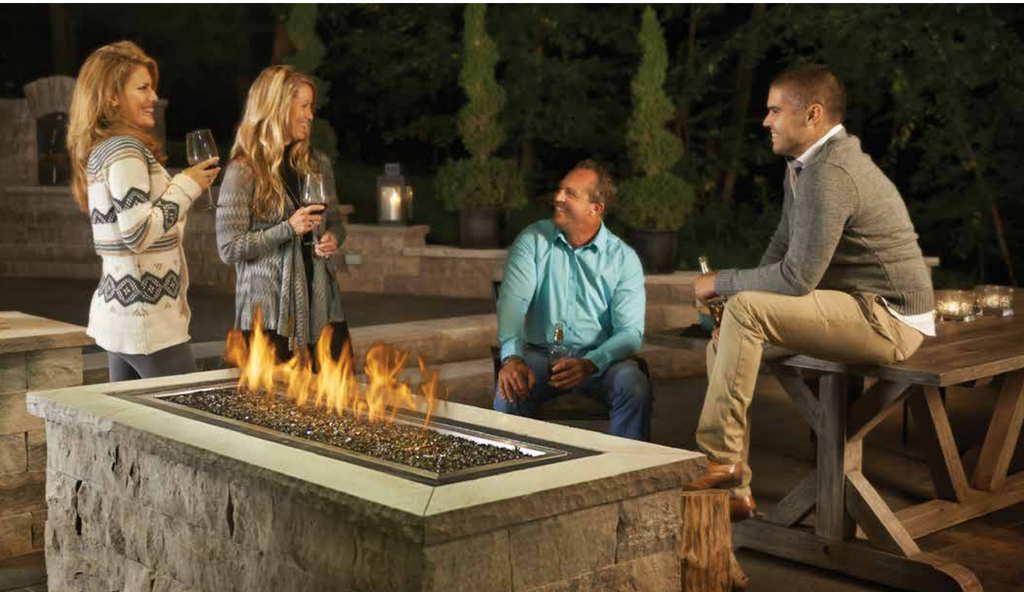
The Linear Patioflame ® shown with standard Topaz CRYSTALINE ™ ember bed installed in a built-in custom application