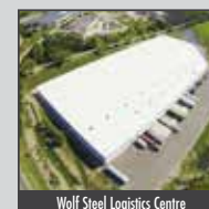
Wolf Steel Logistics Centre