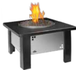
Table and Black Granite Top (optional)