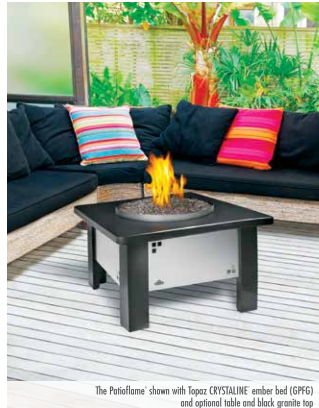
The Patioflame® shown with Topaz CRYSTALINE® ember bed (GPF6) and optional table and black granite top