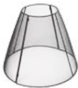
Safety Screen (optional)