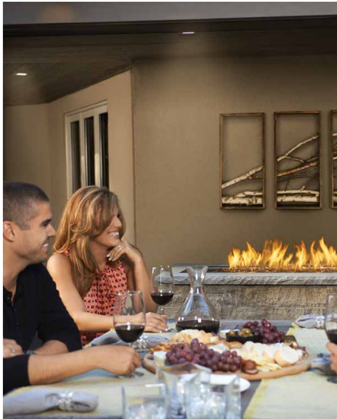
The Linear Patioflame® shown with standard Topaz CRYSTALINE® ember bed installed in a custom built-in application