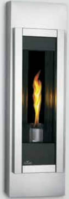
The Riverside Torch™ shown with standard brushed stainless steel frame and cabinet