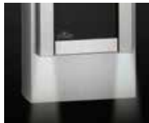
Upper/Lower Accent Lights Four Lights Included (optional)