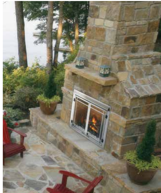
The Riverside™ 42 shown with decorative Sandstone brick panels