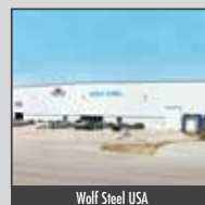
Wolf Steel USA