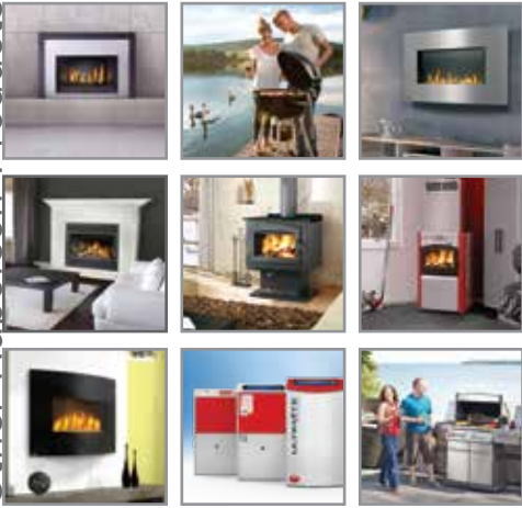
Fireplace Inserts • Charcoal Grills • Gas Fireplaces • Mantels • Wood Stoves Hybrid Furnaces • Electric Fireplaces • Heating & Cooling • Gas Grills