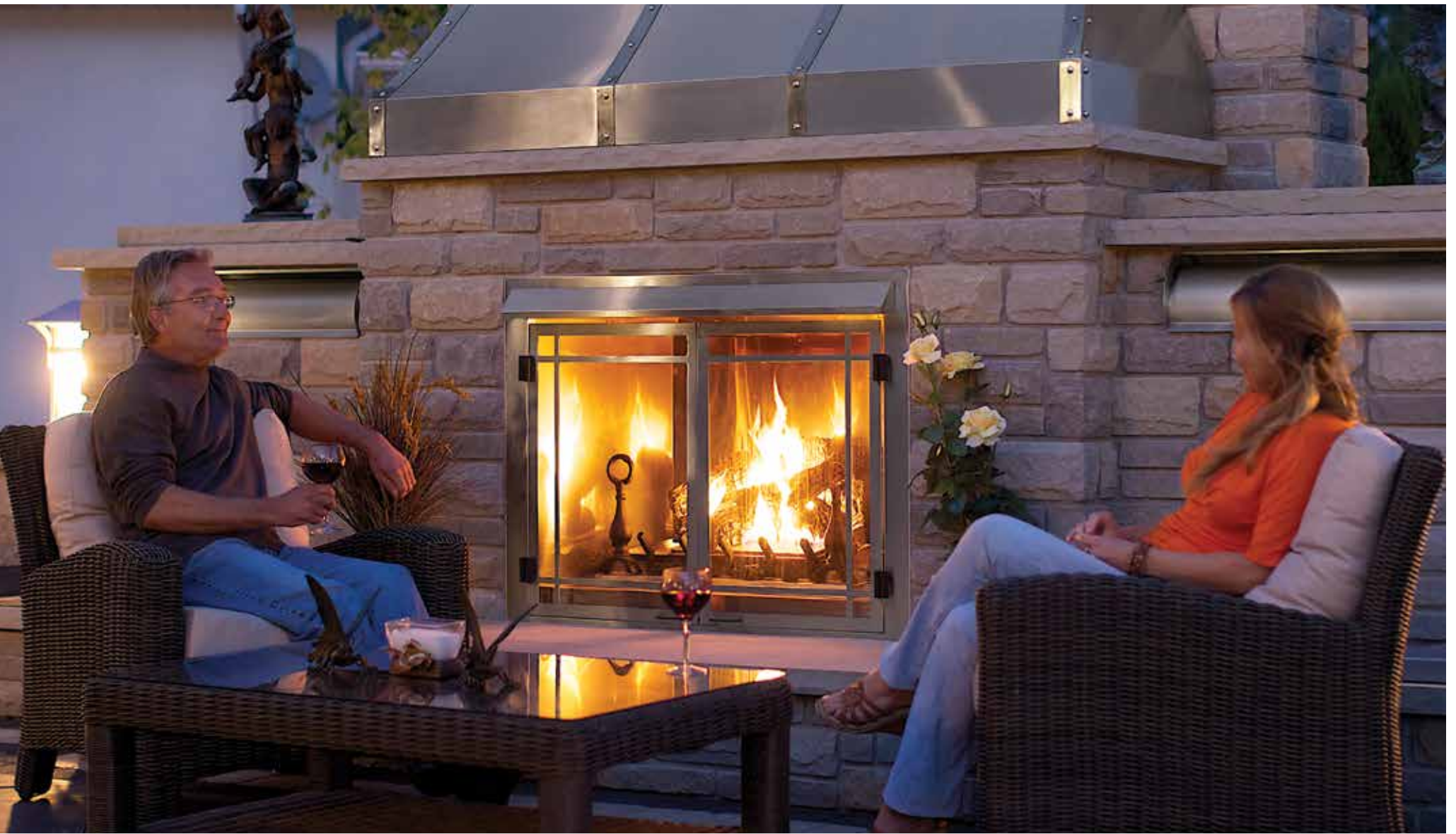
The Riverside™ 42 shown with standard stainless steel decorative door and cast iron andirons