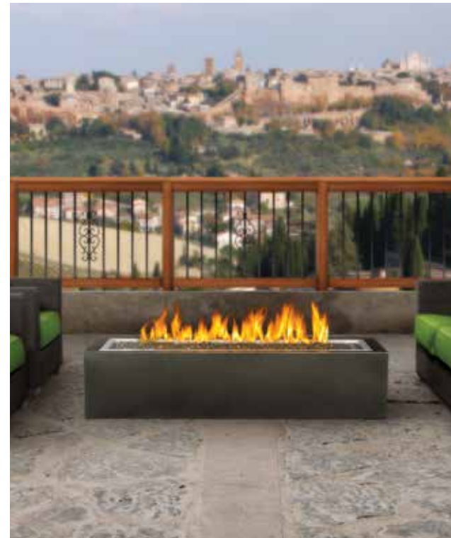
The Linear Patioflame® shown with standard Topaz CRYSTALINE™ ember bed and cabinet