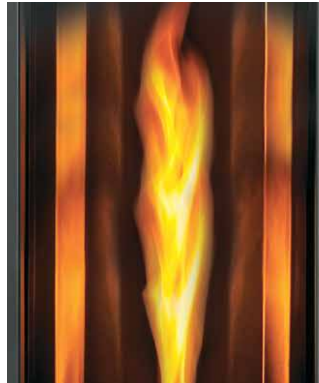
The Riverside Torch™ flame pattern

Riverside Torch™ - GSST8 6,000 BTU's 49 1/16" h x 15" w x 7 5/16" d Natural gas or propane