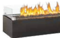
Glass Wind Deflector (optional)