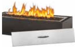
Brushed Stainless Steel Cover* and Hammertone Pewter Cabinet (standard)