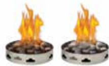
Optional River Rock Media Kits Multi-Coloured or Grey Finishes