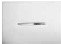
Fireplace Cover Brushed Stainless Steel (standard)