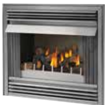
Safety Screen Brushed Stainless Steel (standard)