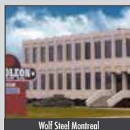
Wolf Steel Montreal