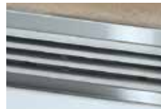
Upper/Lower Louvres Brushed Stainless Steel (standard)