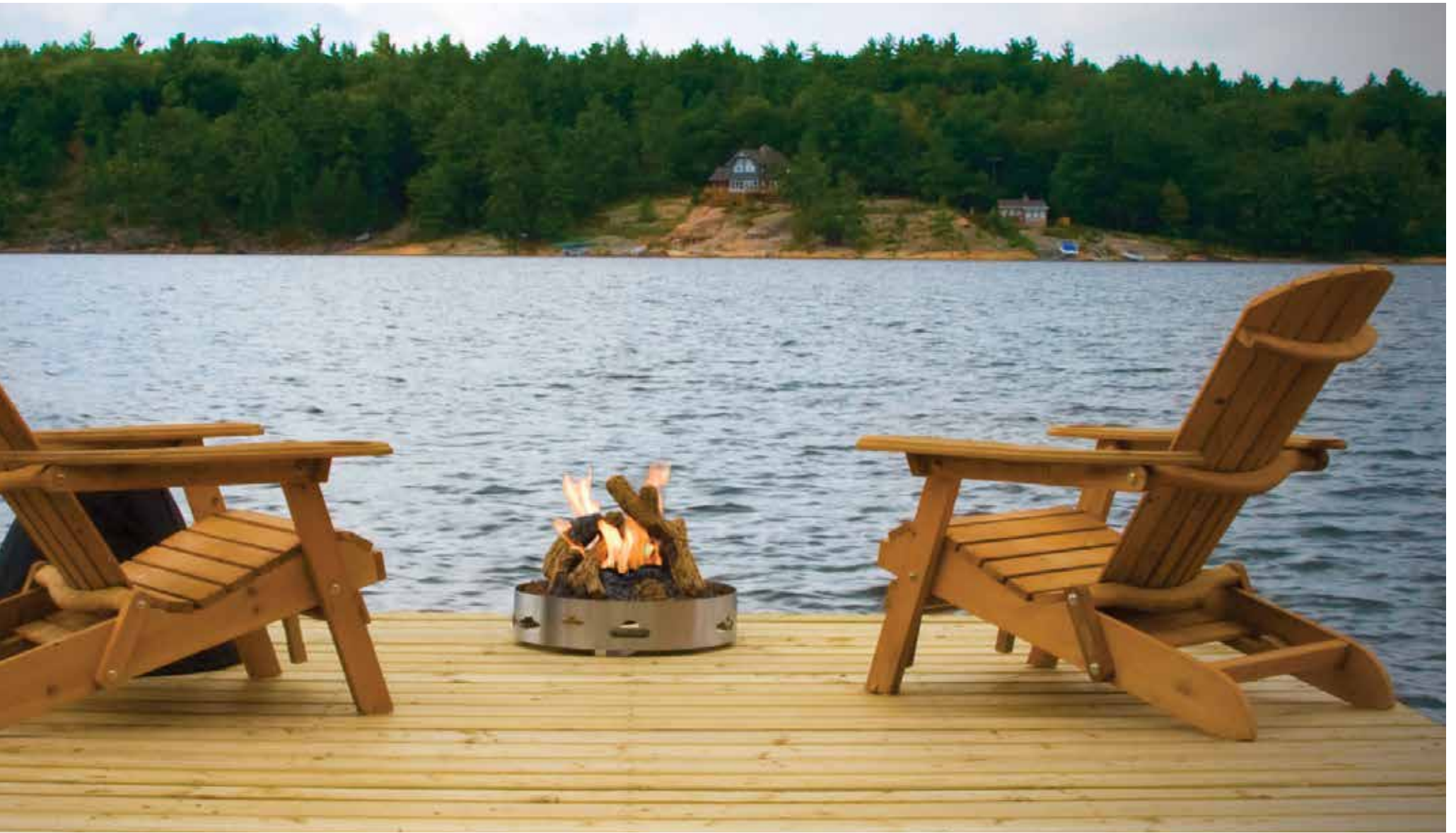
The Patioflame ® shown with Topaz CRYSTALINE ™ ember bed (GPFG) and optional table and black granite top