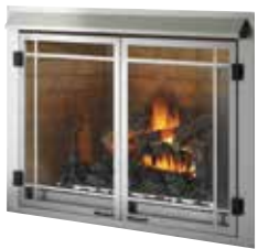
Decorative Door Brushed Stainless Steel (standard)