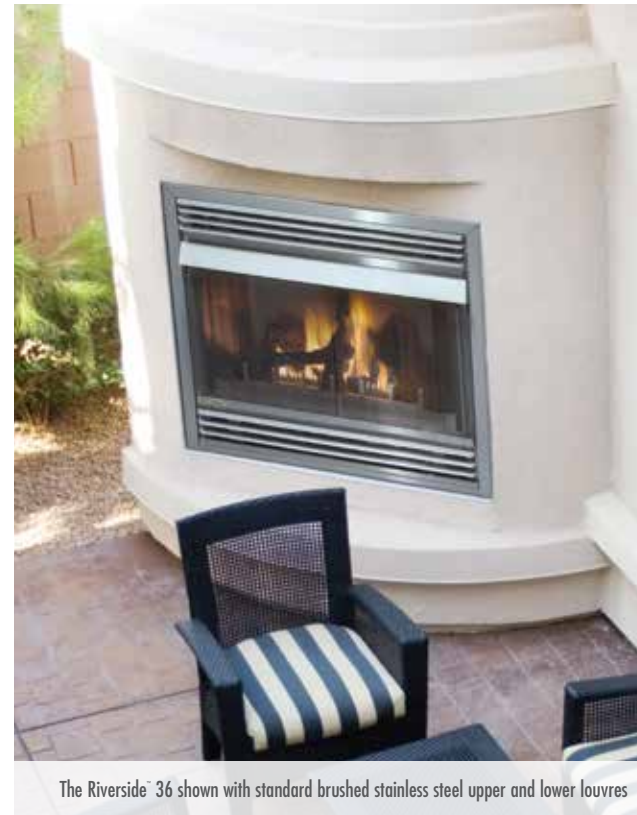
The Riverside™ 36 shown with standard brushed stainless steel upper and lower louvres