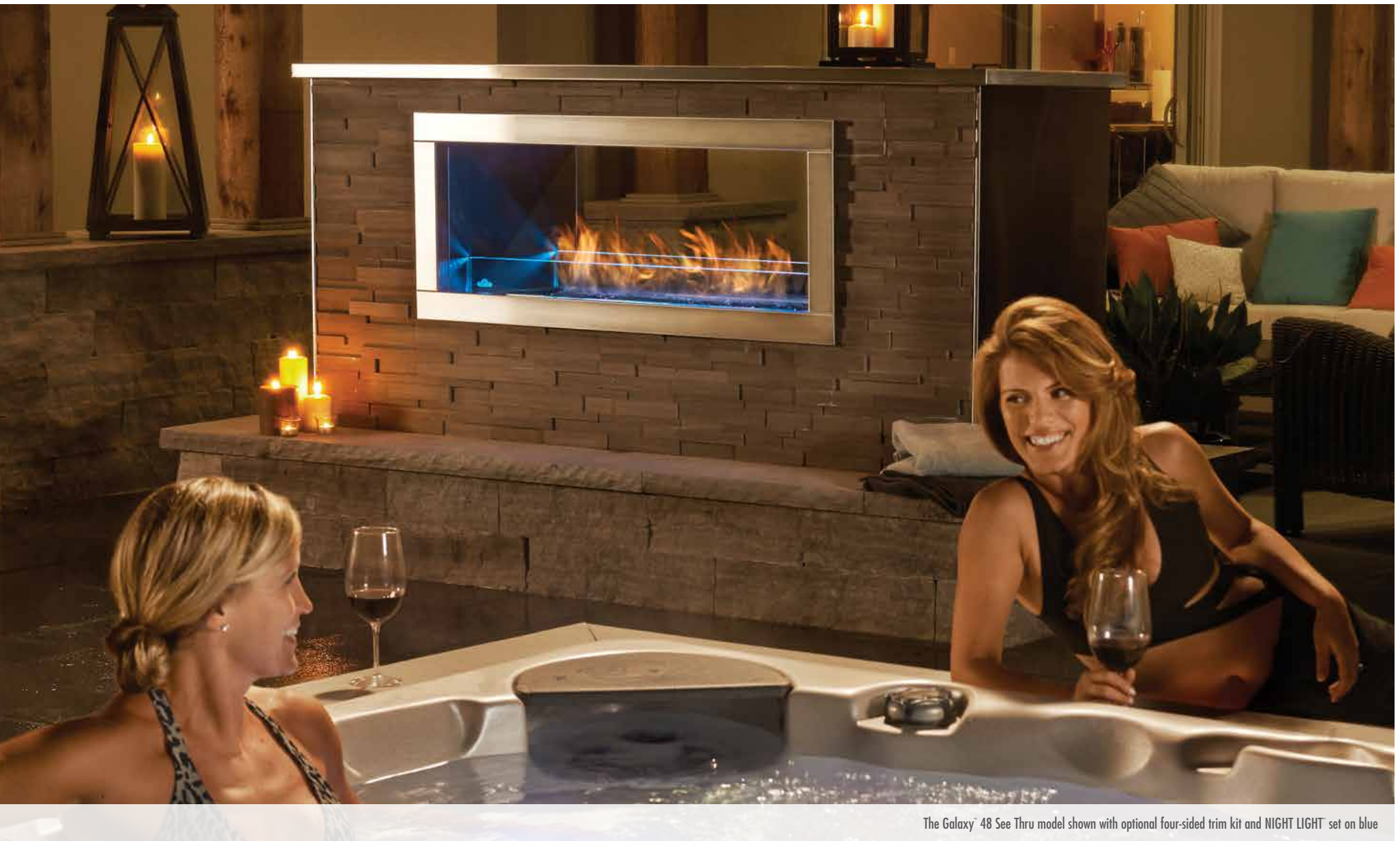
The Galaxy™ 48 See Thru model shown with optional four-sided trim kit and NIGHT LIGHT™ set on blue