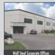
Wolf Steel Corporate Offices