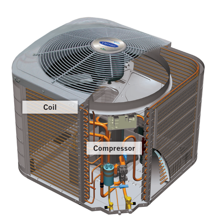
Performance™ 16 Heat Pump shown