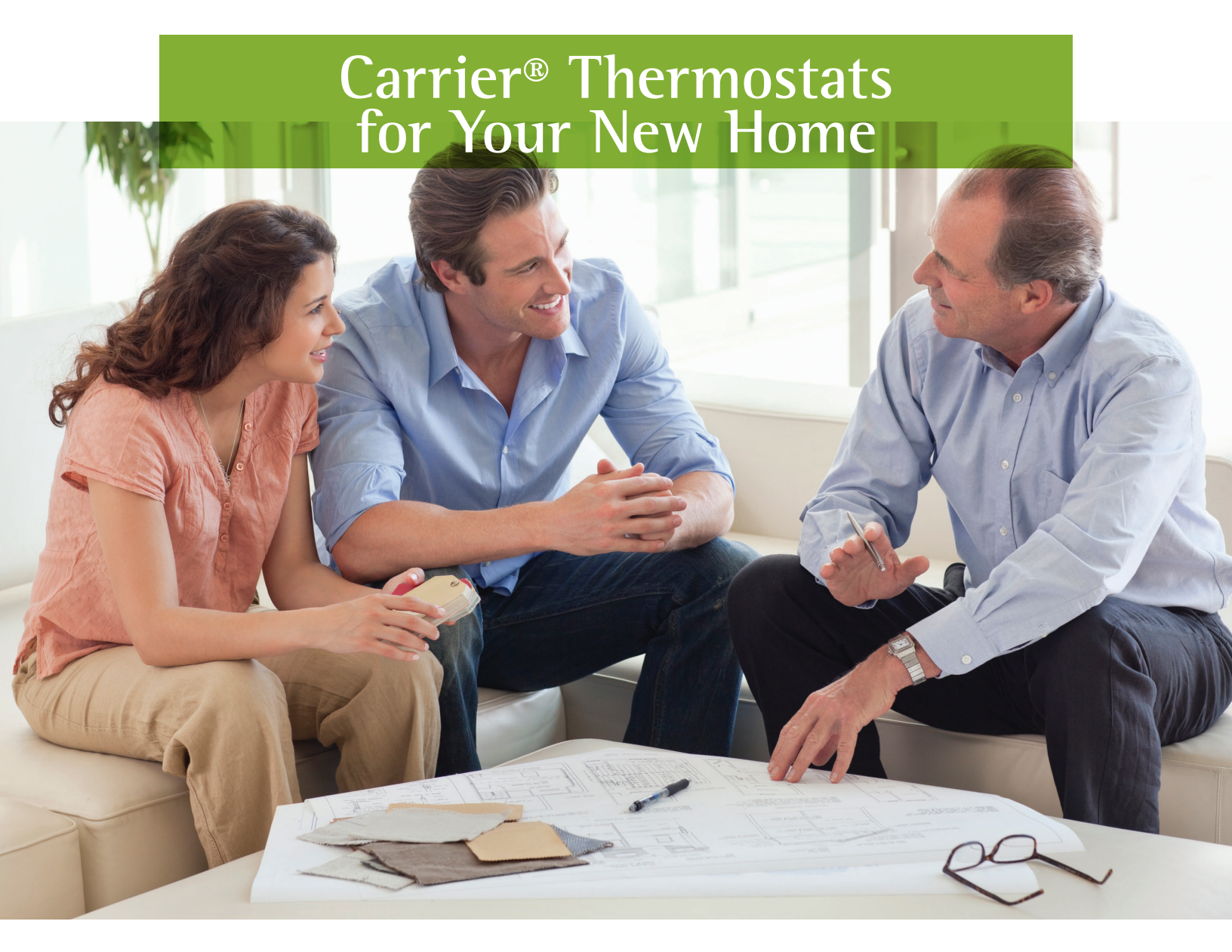
Energy savings, comfort and wireless control