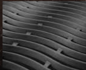
PORCELAINIZED CAST IRON WAVE™ REVERSIBLE CHANNEL COOKING GRIDS (EXCLUDING SIB MODELS)