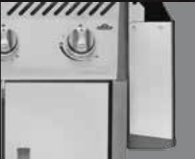
FOLDING SIDE SHELVES