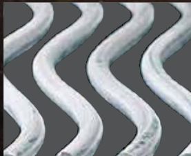
STAINLESS STEEL WAVE™ COOKING GRIDS (SIB MODELS)