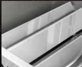
DUAL-LEVEL STAINLESS STEEL SEAR PLATES