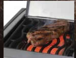
INFRARED SIZZLE ZONE™ SIDE BURNER (SIB MODELS)