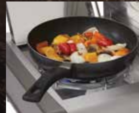
RANGE SIDE BURNER (SB MODELS)