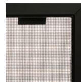
Safety Screen Barrier