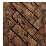
Herringbone Brick Liner RLH