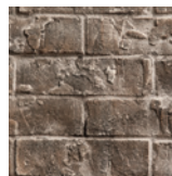
Traditional Brick Liner RLT