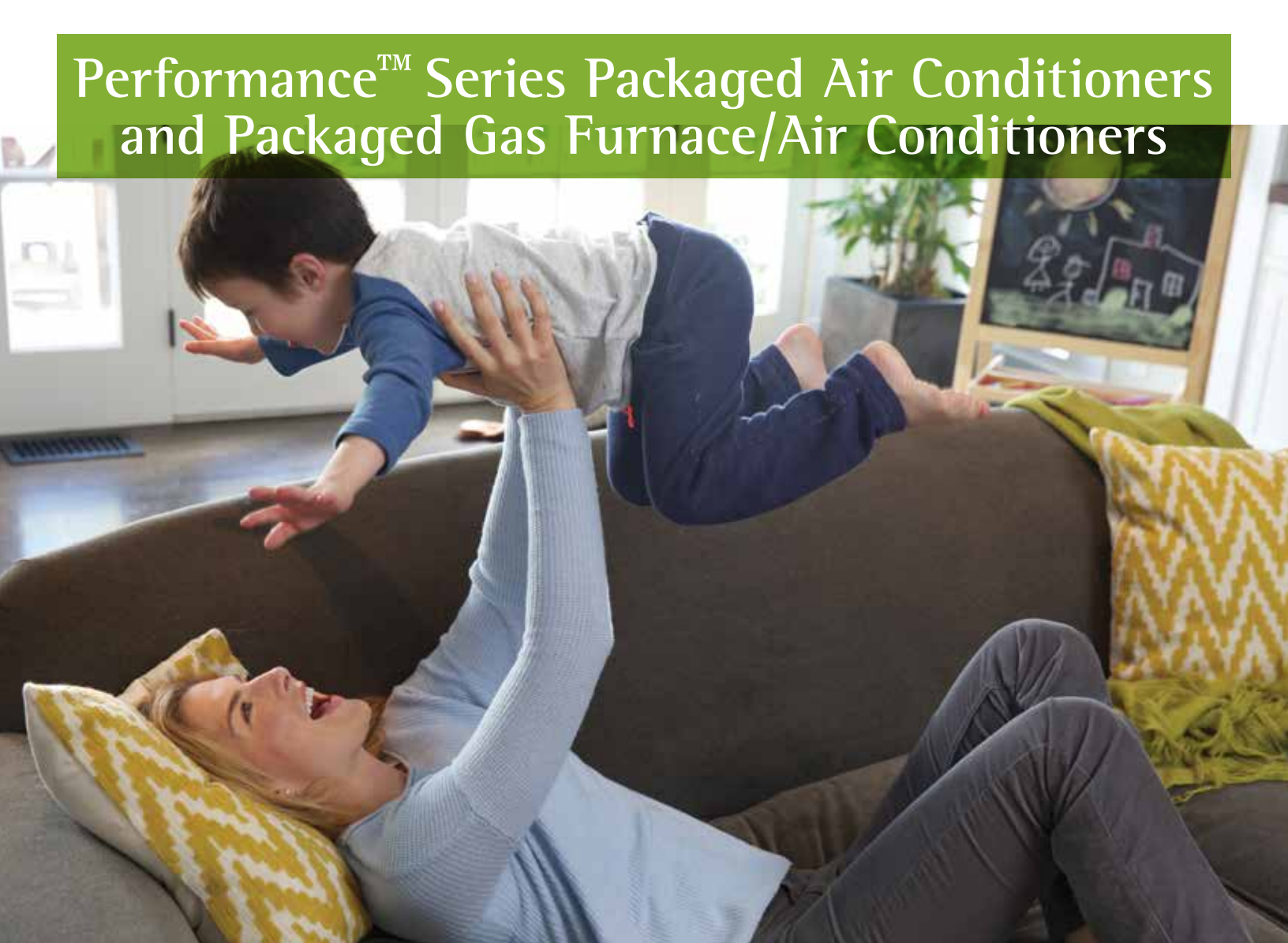
High-efficiency packaged products with your comfort in mind