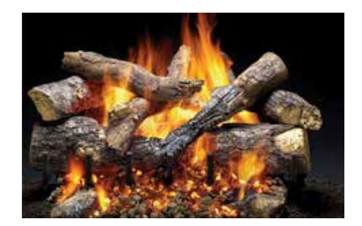
Fireside Grand Oak

Six different log set designs let you achieve the look you want, in sizes to fit almost any firebox. For the most realistic appearance, we recommend selecting the largest logs your fireplace will accommodate (refer to sizing guide on back of brochure).