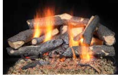
Fireside Supreme Oak

18", 24" & 30" (See-through set in 18" & 24")