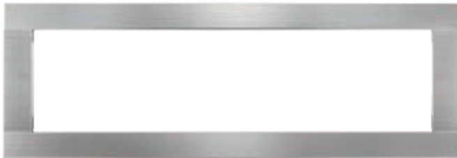
Stainless steel surround