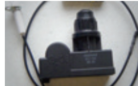
AAA Battery not included.