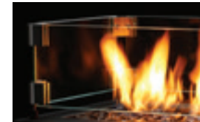
5 1/2" Height

OB24WG (24" Burners OB24) OB36WG (36" Burners OB36) OB48WG (48" Burners OB48) OB72WG (72" Burners OB72) OB96WG (96" Burners OB96)