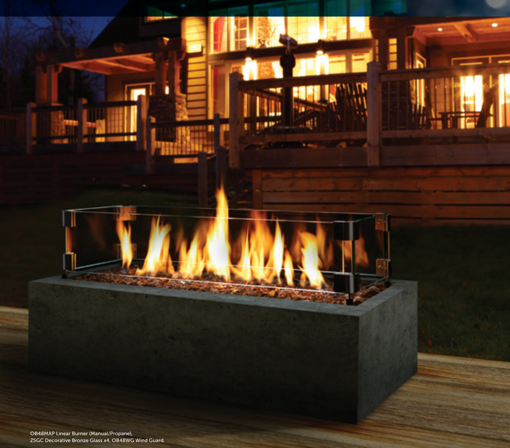
OB48MAP Linear Burner (Manual/Propane), Z5GC Decorative Bronze Glass x4, OB48WG Wind Guard.