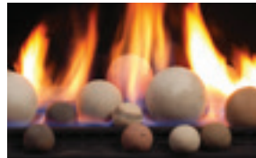
Assorted size and colors (14 pc)