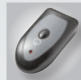
Black and Grey Remote Millivolt (On/Off)

Plus, adding decorative glass, cannonballs and wind guard options ensure you create the look you want. When you have achieved your desired look, invite family and friends to gather around for a perfect get together outdoors.