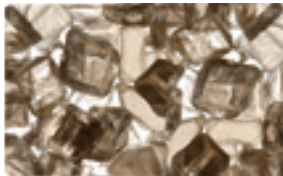
1/2" Bronze (5 lbs)

REQUIRED: 5 lbs per foot of burner (ie: 24" burner = 10 lbs)