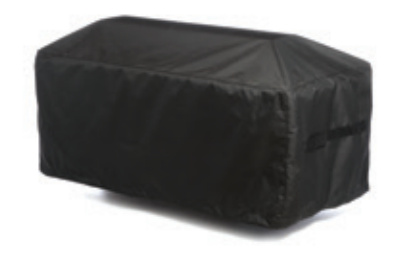
OB24NWC for Narrow 24" tables