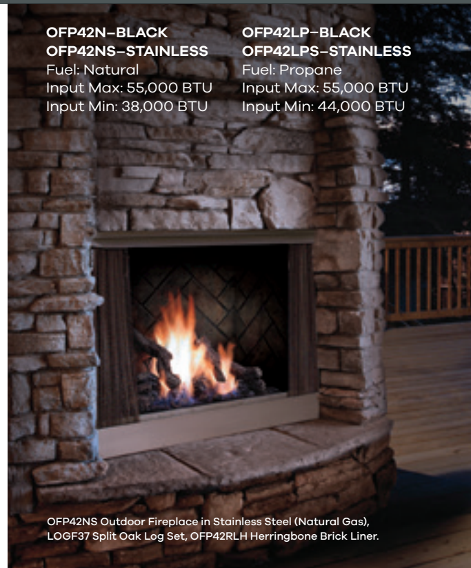
OFP42NS Outdoor Fireplace in Stainless Steel (Natural Gas), LOGF37 Split Oak Log Set, OFP42RLH Herringbone Brick Liner.

OFP42LP-BLACK OFP42LPS-STAINLESS Fuel: Propane Input Max: 55,000 BTU Input Min: 44,000 BTU