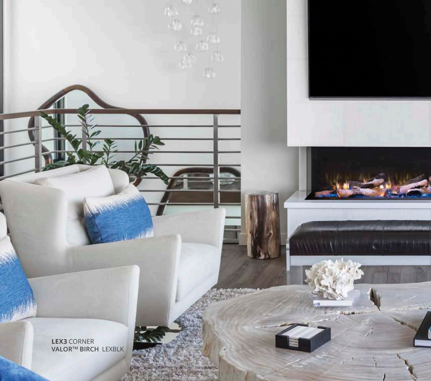
LEX3 CORNER VALOR™ BIRCH LEXBLK