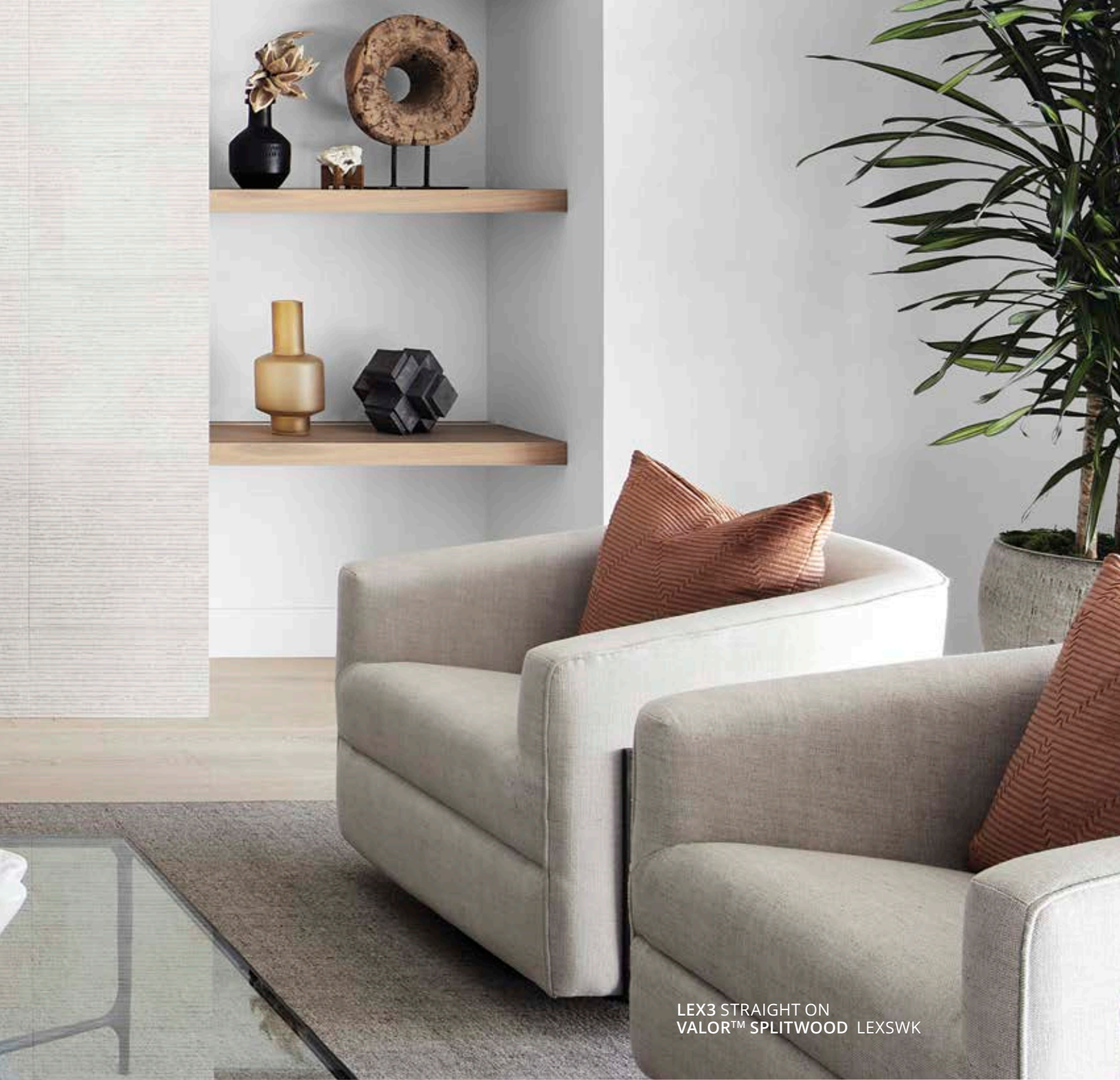
LEX3 STRAIGHT ON VALOR™ SPLITWOOD LEXSWK