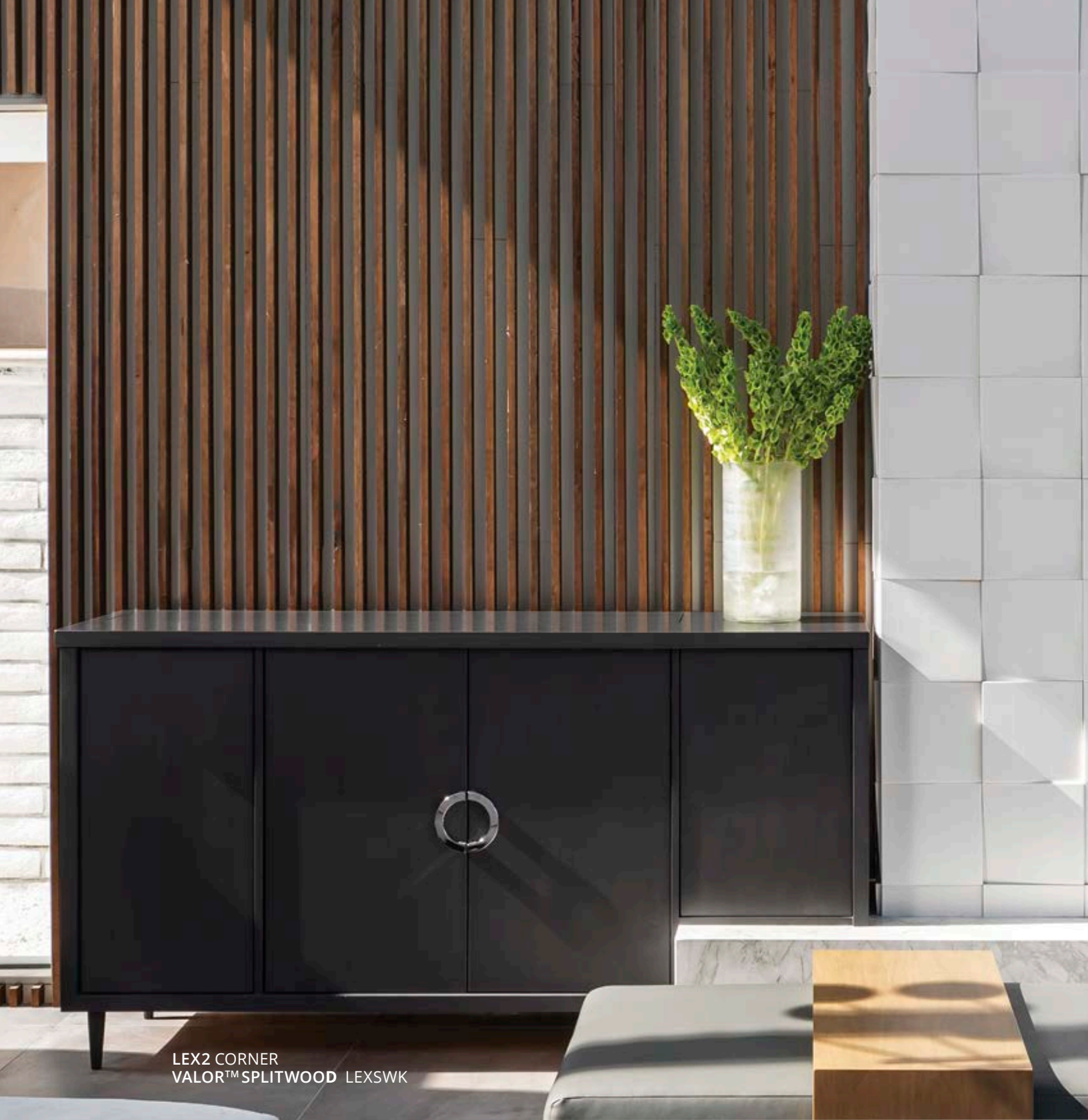
LEX2 CORNER VALOR™ SPLITWOOD LEXSWK