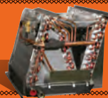
— Uncased Vertical N-Coil CNPVU