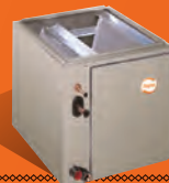
— Cased Vertical N-Coil CNPVP / CNPVT