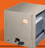
— Cased Horizontal N-Coil CNPHP