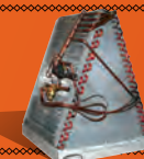
— Uncased Vertical A-Coil CAPVU