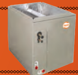
— Cased A-Coils CAPMP (Multi-Poise) CAPVP (Vertical)