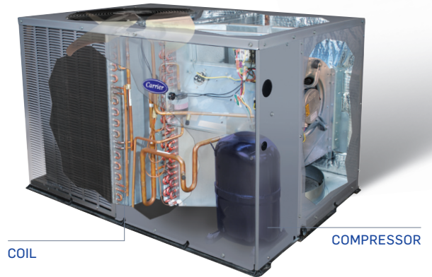
50ZP PACKAGED AIR CONDITIONER SHOWN

The 50ZP packaged air conditioner and 50ZH packaged heat pump are built to look their best while enduring exposure to hail, errant soccer balls, lawn equipment and more.