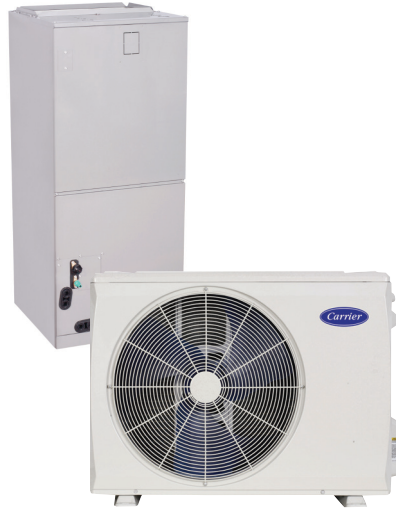
MODEL 38MURA HEAT PUMP with 40MUAA AIR HANDLER

Carrier was the first to offer systems with Puron® refrigerant, which does not contribute to ozone depletion. By replacing an older, less efficient horizontal heat pump with a Performance Series system, you could reduce your energy use and environmental impact.