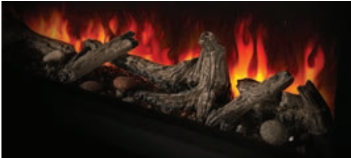
Driftwood logs with woodland kit